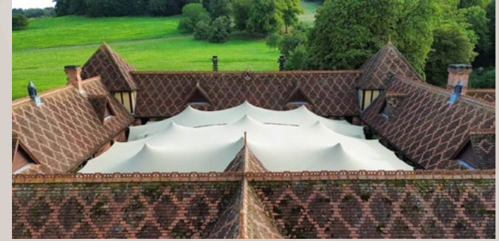
TITAN TENTS www.titantents.co.uk