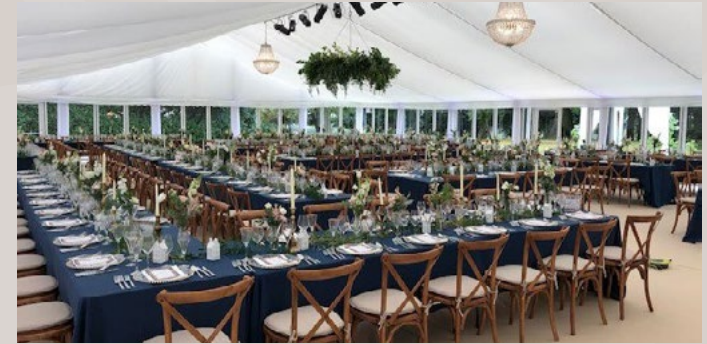
MARQUEES & PAVILIONS LTD www.marpav.co.uk