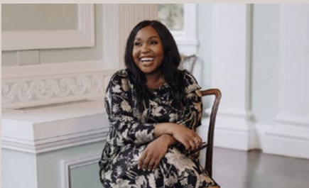
BY CHENAI www.bychenai.com