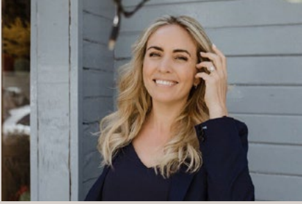
MRS T WEDDINGS www.mrstweddings.com