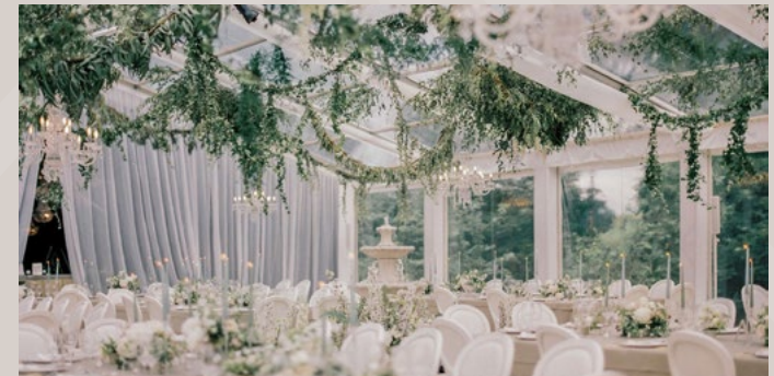
JB MARQUEES www.josephbenjaminmarquees.co.uk