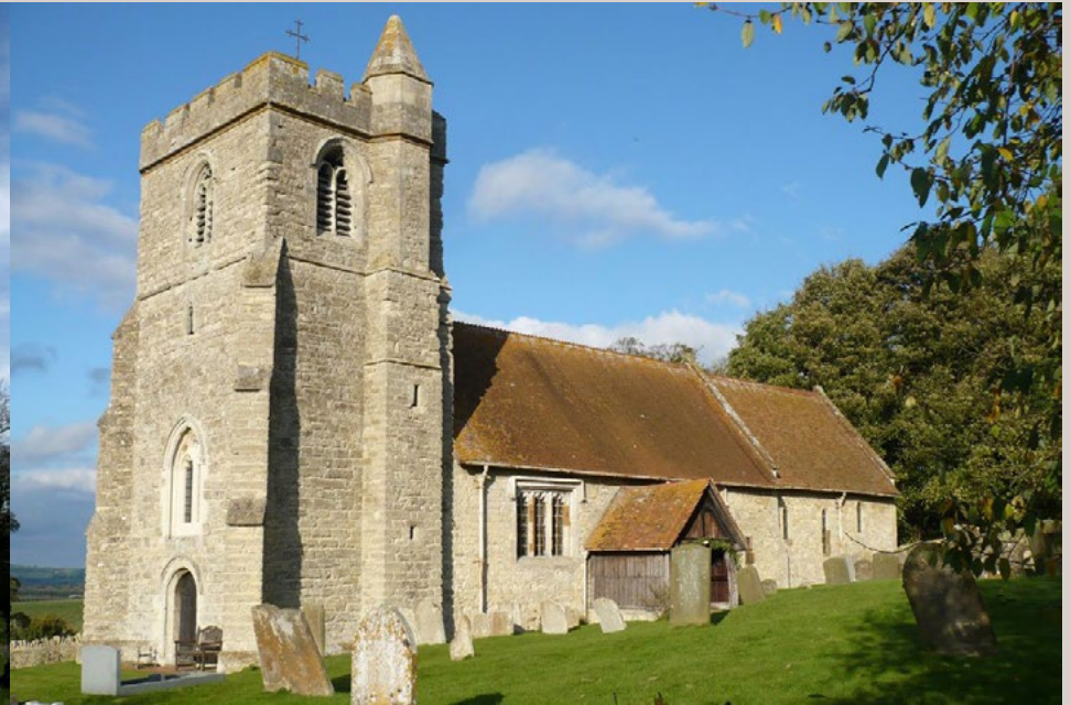
ST. MARY MAGDALENE, UPPER WINCHENDON

St. Mary Magdalene in Upper Winchendon is less than 10 minutes' drive from Waddesdon and is perched on a hill overlooking the valley, this little gem of a church has remained untouched since the middle-ages and can fit 150 guests.