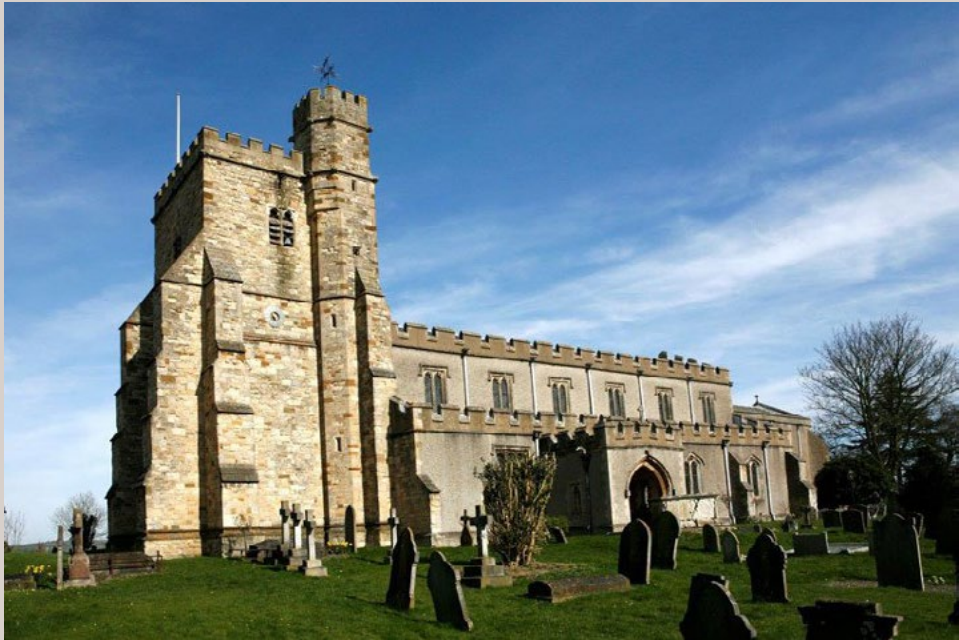
ST. MICHAEL AND ALL ANGELS, WADDESDON

St. Michael and all Angels in Waddesdon can be seen from The Dairy and is a large imposing Grade II* listed building dating from the 12th Century and can fit over 200 guests.